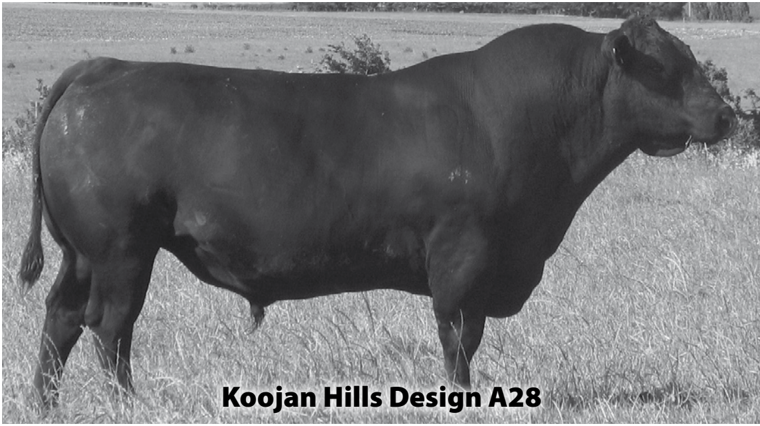
Koojan Hills Design A28