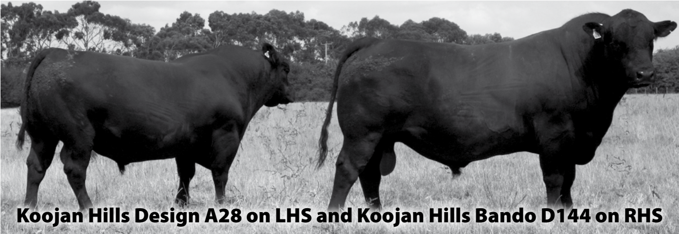
Koojan Hills Design A28 on LHS and Koojan Hills Bando D144 on RHS