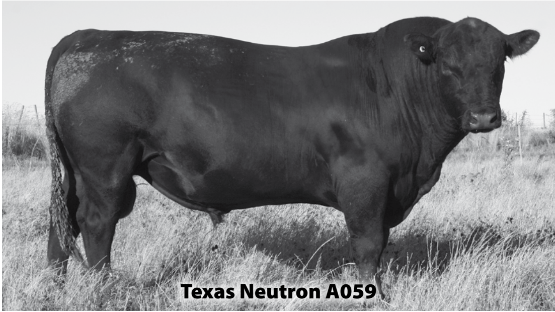
Texas Neutron A059