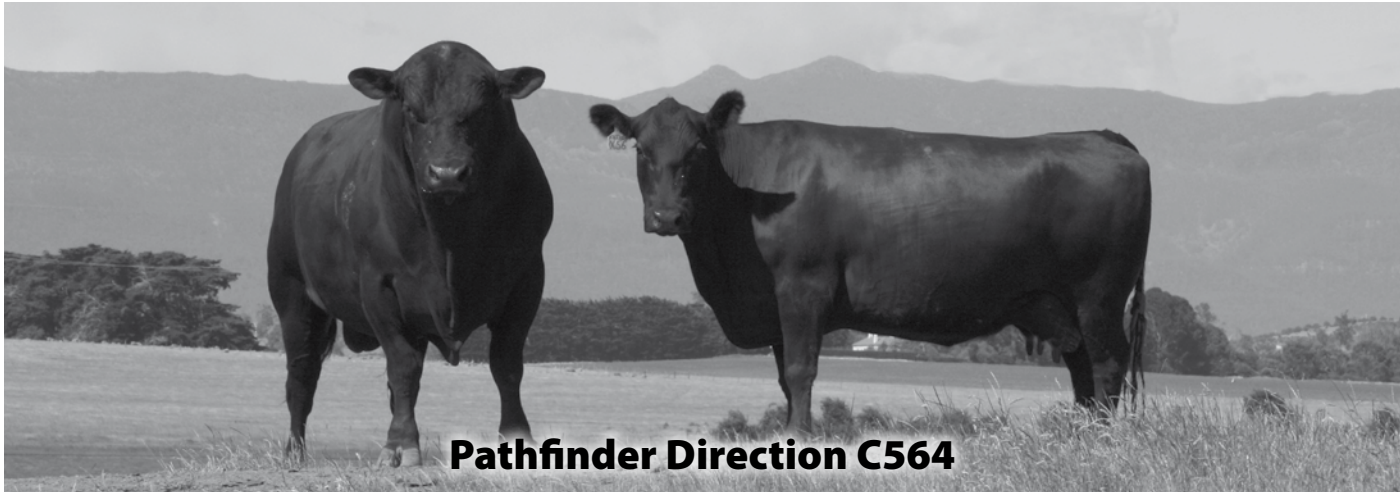
Pathfinder Direction C564