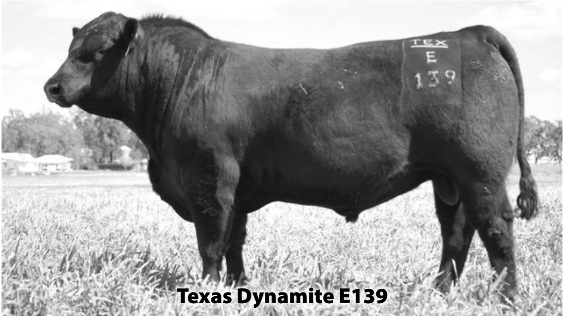
Texas Dynamite E139